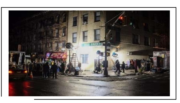
Shooting in progress